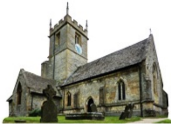
Hampton – Fairfield – Thistledown Eastwick Park – Charity Crescent